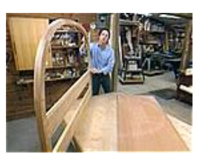
With the frame assembled, its curve can be referenced to create a plywood back-panel.