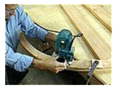
A hand-held router is used to cut a smooth edge on the headboard once it has been assembled.